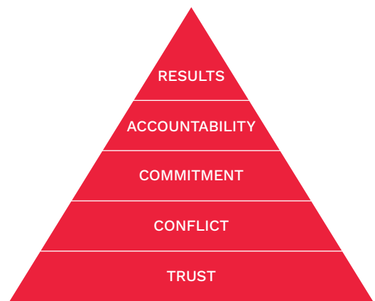
The Five Behaviors Model

The experience is completed through a half-day training session, led by a trained Five Behaviors expert. This session includes a walkthrough of the Personal Development profile, breakout activities, and group discussion.